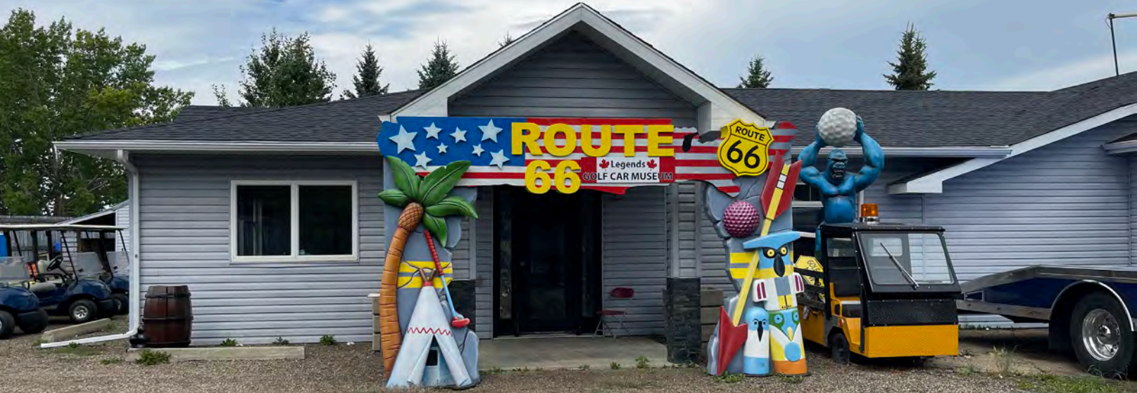
Photo Gallery - Legends Golf Car Museum